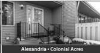
Alexandria • Colonial Acres