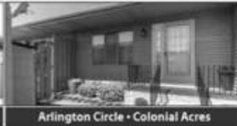
Arlington Circle • Colonial Acres