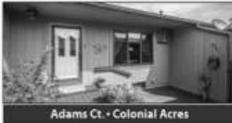
Adams Ct. • Colonial Acres

"We offer a competitive listing fee that we know would excite any seller"