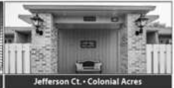
Jefferson Ct. • Colonial Acres