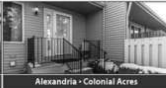
Alexandria • Colonial Acres