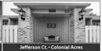
Jefferson Ct. • Colonial Acres