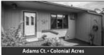
Adams Ct. • Colonial Acres

"We offer a competitive listing fee that we know would excite any seller"